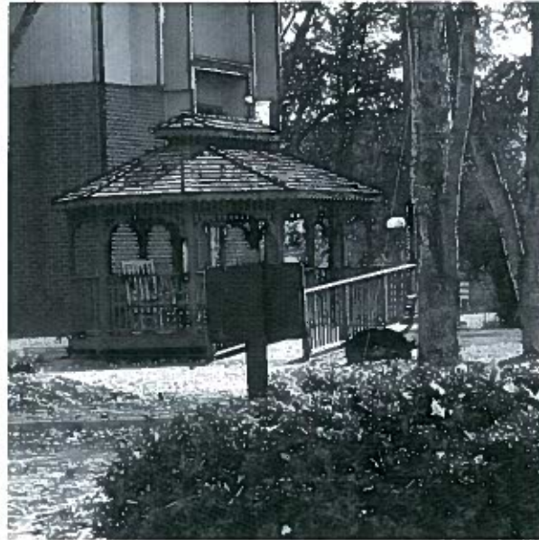
PETERSBURG TOWERS APARTMENTS —Left: A view of the grounds at Petersburg Towers. This features a gazebo where residents can gather for circle or committee meetings, or just while away the day.